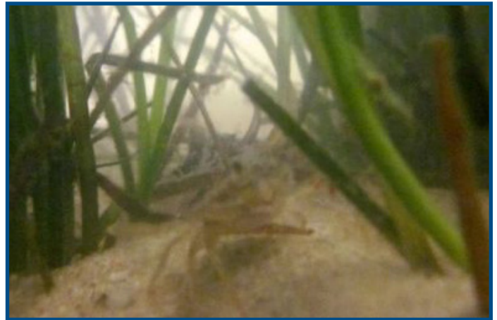
In the Grass: Thicker seagrass beds provide better nursery habitat for juvenile blue crabs.

“Vegetated habitats, particularly marsh and seagrass, have long been known as nurseries for blue crabs,” says Ralph, “with many previous field and lab studies showing higher density, survival, or growth of juveniles in seagrass habitats compared to un-vegetated areas nearby.”