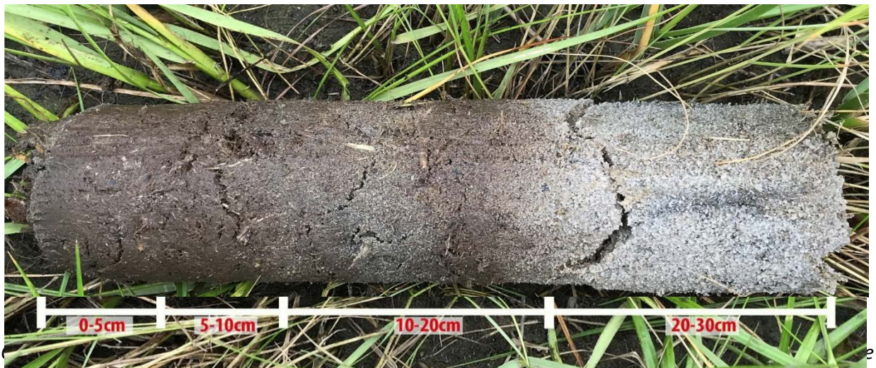
core (20-30 cm) versus the darker, organic components near the top of the core (0-5 cm).

Findings: Relative to most of the natural marsh soils, the Living Shoreline soils are on average significantly higher in bulk density and lower in organic matter and total carbon, nitrogen and phosphorus. Among Living Shoreline-natural marsh pairs, however, variance among these metrics was high.