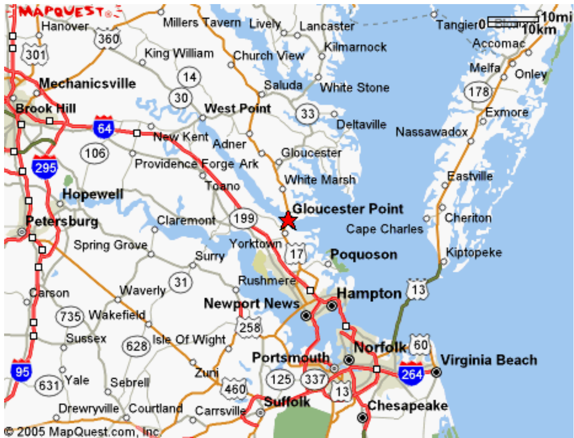
Gloucester Point Map: Larger Scale

VIMS address: Route 1208 Greate Road Gloucester Point, VA 23062