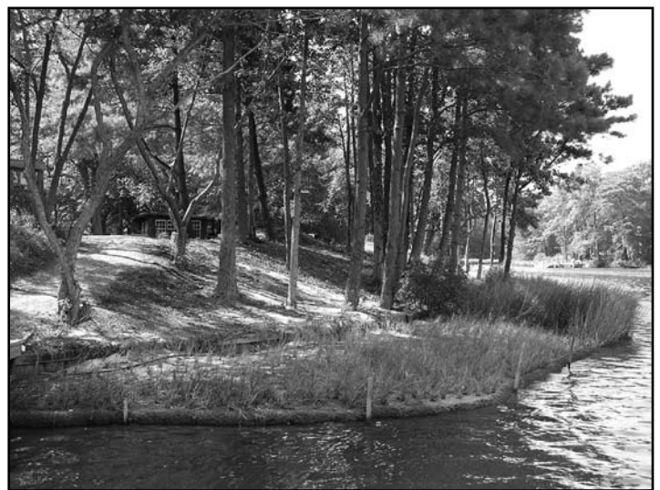
Figure 1. Fiber logs provide temporary soil containment and protection for planted marshes until the root system becomes established.

Fiber logs decay in five years or less. They may need to be replaced if the planted marsh does not stabilize before the logs break down. They have also been placed along undercut banks where excessive shading prevents the growth of marsh vegetation. The effectiveness of using fiber logs to reduce the undercutting effect of tidal currents and boat wakes is still under investigation, but it is assumed that they must be inspected regularly and replaced periodically.