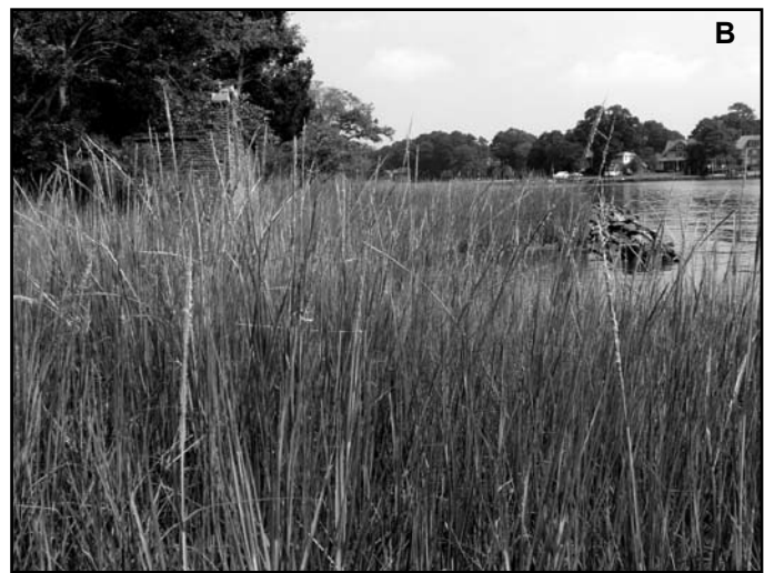
Figure 1. Living shoreline using a segmented sill design at the Hermitage site in Virginia (a) immediately after planting (May 2006) and (b) the following summer (August 2007).