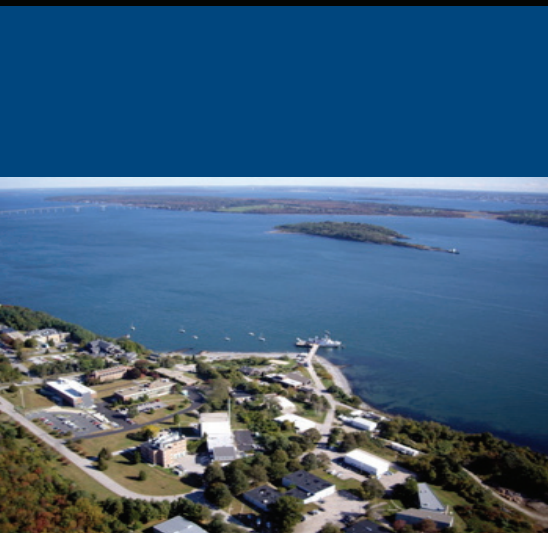
The Coastal Institute is located at the University of Rhode Island’s Graduate School of Oceanography, pictured here.