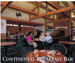
CONTINENTAL BREAKFAST BAR

Choose it for the value . . . enjoy it for the amenities. This contemporary, 300-room hotel offers moderately priced, comfortable accommodations for every size group.