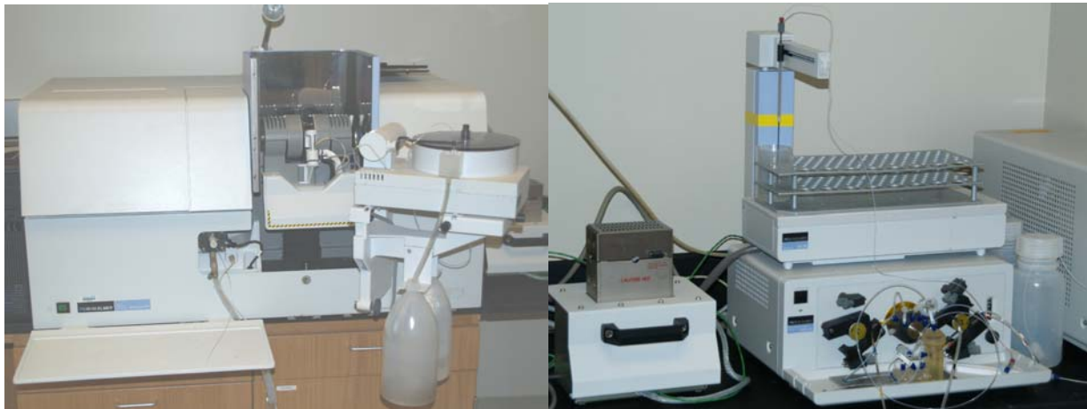
A Perkin-Elmer atomic absorption spectrophotometer provides the central analytical capabilities of this laboratory. It includes a transversely-heated graphite furnace (shown in left image) which can be automatically shifted out of the light path to be replaced by a flame unit. Shown on the right is a FIAS unit for hydride generation and cold vapor analyses.