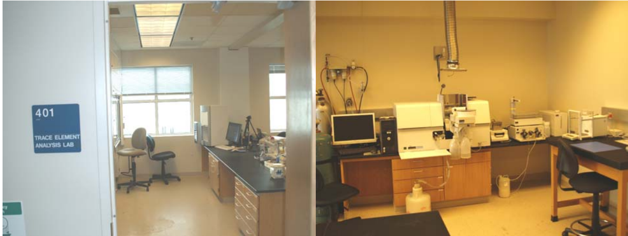
The Trace Element Analytical Laboratory is well equipped for a wide range of projects but has strong trace element capabilities.

A dedicated direct mercury analysis unit is also available which can directly analyze a variety of solid samples with minimum preparation and chemical waste generation. Also available is a LemnaTec image analysis system used to quantify growth or movement effects of toxicants.