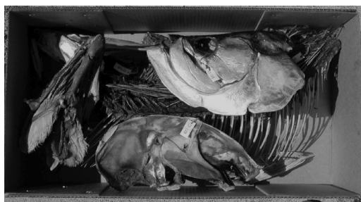
Fig. 2. A partially articulated specimen of a large Atlantic tarpon, Megalops atlanticus , in a suitable box ready for the dermestid colony. Each piece has a tag with specimen's field number. This specimen was prepared using the Ridewood dissection method; the inner surface of the right cheek and jaws is visible below and the gill arches can be seen on the left.

Once the gill arches have been removed from the specimen, it is easy to complete a Ridewood dissection. Beginning at the posterodorsal corner of the right operculum, cut the muscles linking it to the skull. Then work forward to separate the right hyomandibula from its articulation with the otic region of the braincase (work the joint back and forth to help loosen this articulation). Cut the symphysis between the left and right lower jaws and carefully cut between the left and right premaxillae. Continue this last cut into the oral mucosa, separating carefully between the right palatal bones and median structures such as the vomer and parasphenoid. Work the joints between the palatal