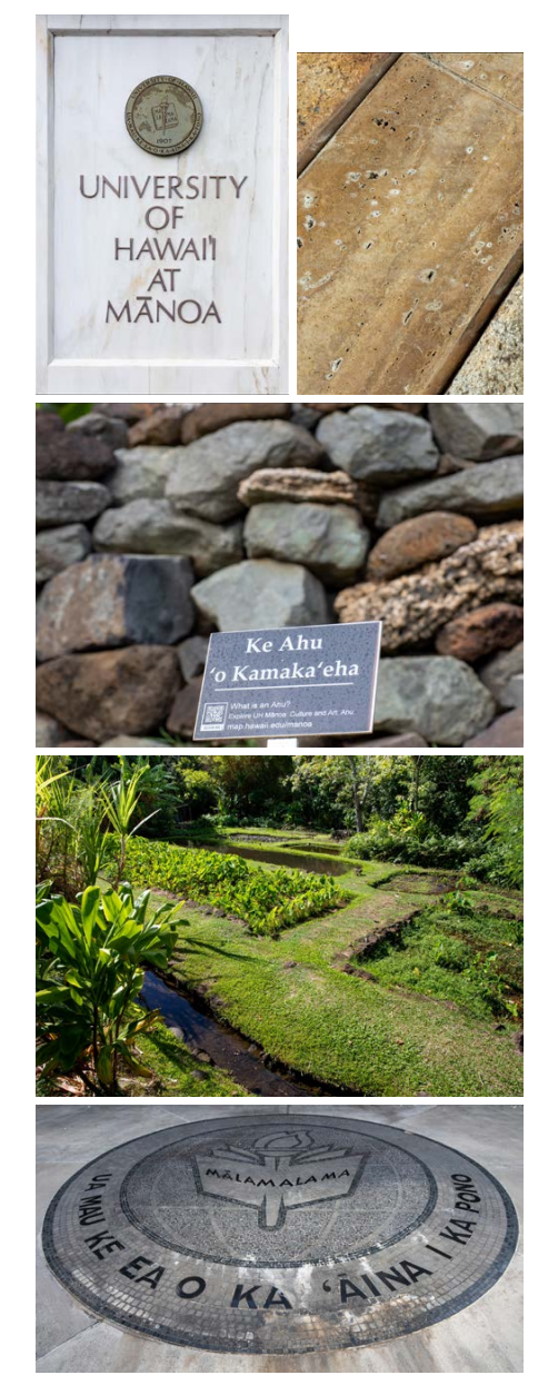
FIGURE 1. The University of Hawai'i huaka'i (walking tour) of the Mānoa campus interweaves Hawaiian cultural, historical, and geological perspectives.

In their open-ended comments, participants self-reported feeling more culturally connected and articulated plans for making their class content more place based. We are encouraged by these results and hopeful that this will ultimately translate into improved student learning outcomes.