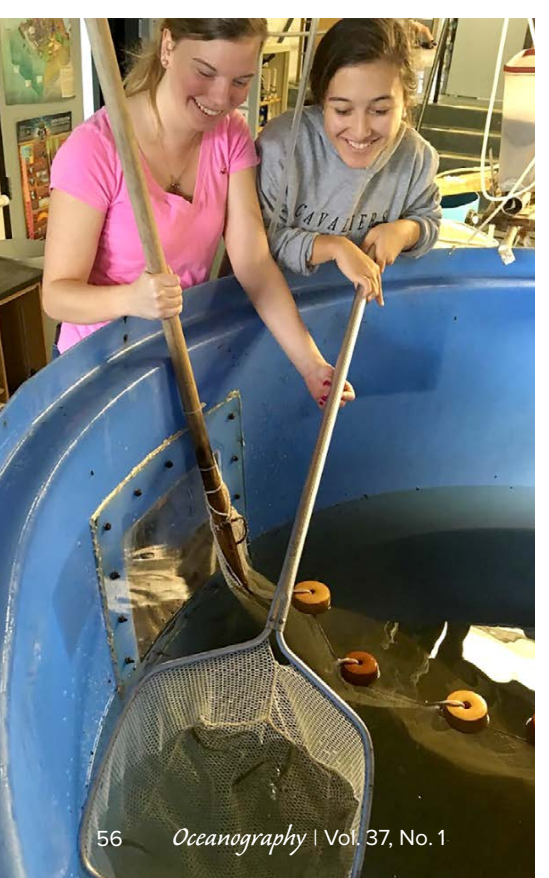
FIGURE 2. Two students use a seine net and a dip net to isolate native species of fish for release into a local stream.

expanding technology and growing economic sectors of applied sciences like aquaculture and aquaponics. By directly working with teachers and administrators to enhance curriculum choices, global scientific issues can be addressed, and appropriate instructional strategies can be developed for teacher PD and ultimately programs that focus on studentdriven participation in STEM.