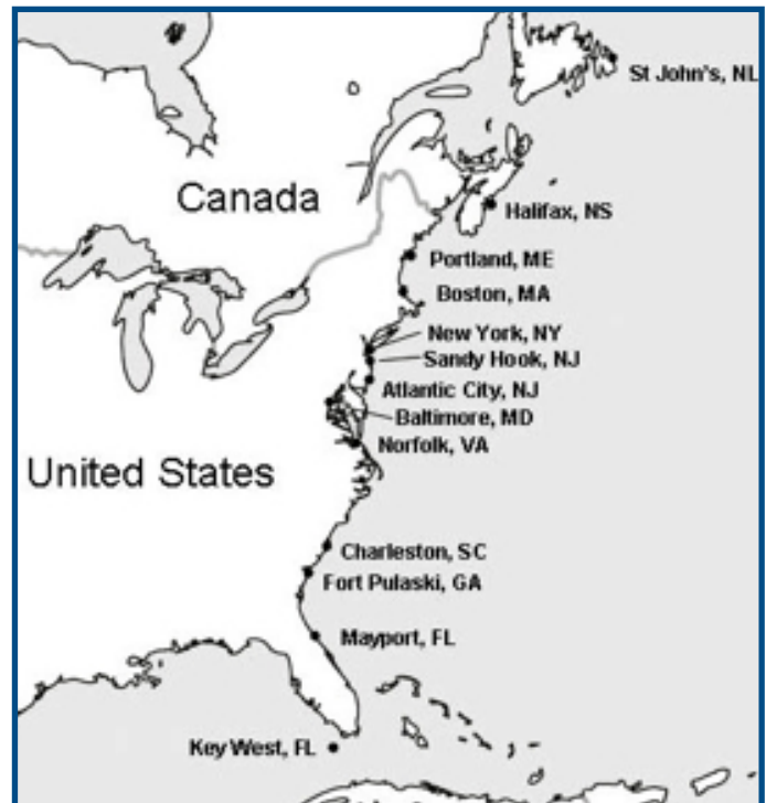
Location of tide stations on the Atlantic coast of North America. Sea-level data for U.S. tide stations are collected and distributed by NOAA's National Ocean Service.