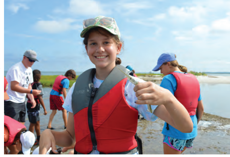
A high school camper finds a fish while seining at summer camp.