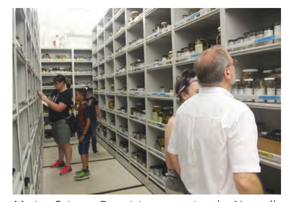
Marine Science Day visitors examine the Nunnally Ichthyology Collection.

What began in the 1950s as an uncatalogued collection of fishes gathered from research and used primarily for teaching and VIMS research, has grown into a magnificent global resource with a full-time collection manager.