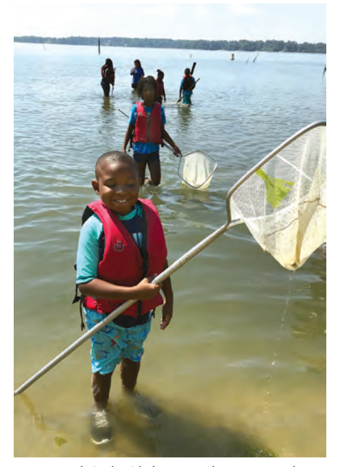
Boys and Girls Clubs members visited VIMS in the summer and were able to do some beach seining.

science lessons. They also talk to the youth about careers in marine science and their paths to graduate school. Several members of the clubs also attended a field trip to VIMS this summer, where they used seines to collect and observe plants and animals in the York River. They also visited research laboratories on the VIMS campus in Gloucester Point, including the Zooplankton Lab (pictured at left). The program was made possible through a grant from the Arconic Foundation.