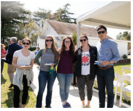
VIMS students enjoy dedication festivities.