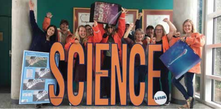
Staff from the Center for Coastal Resources Management stand with science.

During the day, VIMS posted fun pictures and videos to keep everyone engaged, including pictures of students, staff, faculty, and friends posing with the VIMS science sign and explaining why they #StandWithScience.