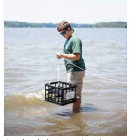
A student deploys oysters in Urbanna as part of the Citizen Scientist program.

Every gift to the VIMS Foundation underpins efforts to better understand and protect precious marine environments. Become a VIMS supporter by making a gift of any size at www.vims.edu/ giving or by using the enclosed envelope.