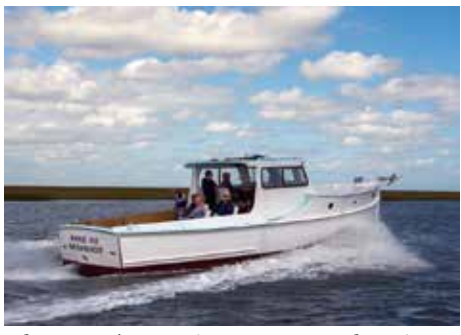
The Bonnie Sue is an Eastern Shore icon.

parts in several research studies being conducted. Being exposed to different projects allowed me to learn what I did and did not like as I shaped my career goals."