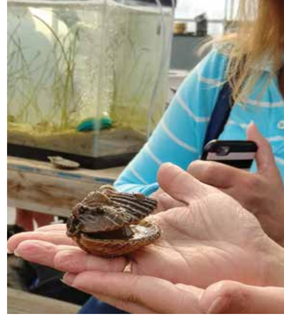
Donors visit VIMS to see live Bay scallops from the Eastern Shore.

"With the monies raised from Tribefunding we are now working with several shellfish aquaculture farmers to raise large numbers of juvenile Bay scallops." Dr. Orth said. "In spring