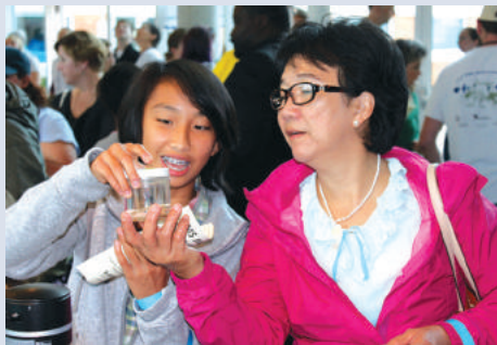
Visitors enjoy activities at VIMS' 2016 Marine Science Day.

Visitors will learn how VIMS scientists breed oysters, survey fish populations, restore seagrasses, and help manage blue crabs, among many other highlighted programs. All Marine Science Day activities are free. Register in advance to save time at check-in: www.vims.edu/msd .