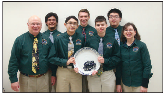
2017 Blue Crab Bowl winners Bishop Sullivan Catholic High School

Acuff leadership gift, continued from page 1