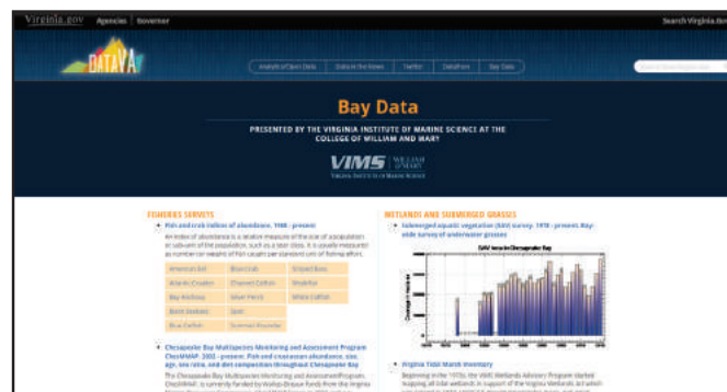
Bay data is now available at data.virginia.gov .