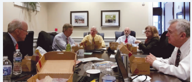
Members of the VIMS and Foundation leadership collaborate during Lobby Day.

At the end of January, the Virginia Institute of Marine Science held its first-ever Lobby Day at the Virginia General Assembly. Members of VIMS’ executive team and Foundation Board met with legislators to champion VIMS in the state budget, while faculty, staff, and students staffed a booth to increase public awareness of VIMS.