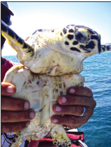
Photograph shows a green sea turtle immediately after it was freed of a cinched plastic tie around its body. The turtle’s body had grown around the plastic tie.